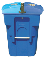
64 gallon split cart