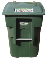
32 or 96 gallon cart