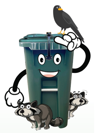
Critters or wind a constant problem? Contact us to request a free lid lock!