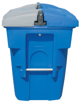
64 gallon split cart