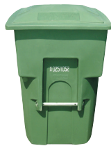
32 or 96 gallon cart