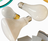
Incandescent light bulbs