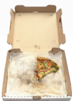
Pizza boxes & other food-soiled paper

Food-soiled paper, food scraps, and yard trimmings all belong in a green ORGANICS bin. In the absence of a green bin, they are best placed in the GARBAGE.