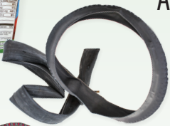
Bike tires & inner tubes