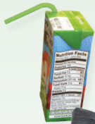
Aseptic cartons & pouches

These items are NOT allowed in a recycling bin. Please put them in the GARBAGE.