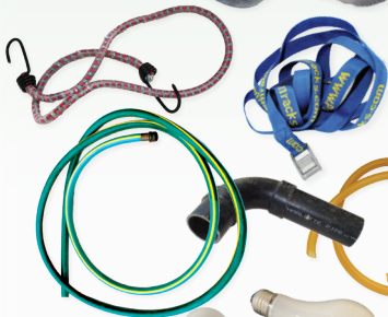
Bungee cords & tie-downs