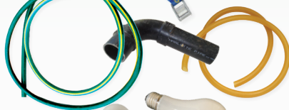
Hoses, pipes & tubes