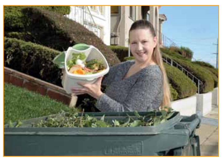
Food scraps and food-soiled paper are now collected along with your yard trimmings. Just put them in your green cart!